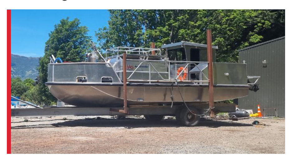
Owned by Akaroa Salmon, 'Hoiho' is a brand new alloy, salmon farm workboat operating in Akaroa Harbour.