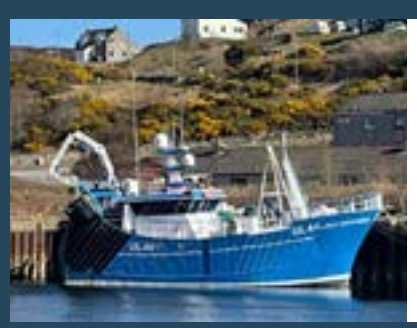
Loch Inchard III

Built at C.Toms & Son Yard, Cornwall for lan Mackay, the 16.5Loch Inchard III will work from Kinlochbervie for prime species such as monkfish and megrim sole. This replaces the owner's older wooden boat I och Inchard II