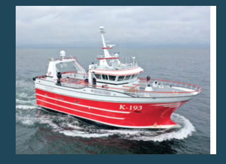
Orkney based Harcus Fishing Company celebrated the launch of their new 28 metre whitefish twin-rig trawler Westra Fjord , from Danish yard Vestvaerftet in July.