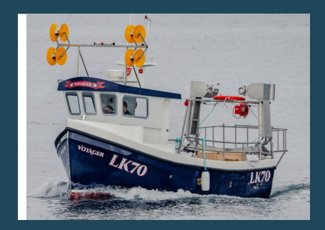
Voyager LK70 built by Audacious Marine on a Cougar Workboat design, this Lerwick based boat will catch mackerel and cod by the jigging method.